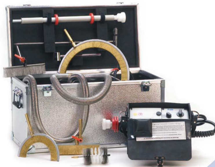
A selection of the wide range of accessories